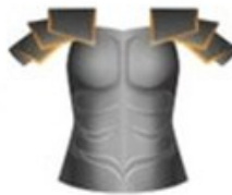
Breastplate of Righteousness