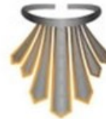
Belt of Truth