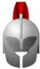
Helmet of Salvation