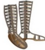
Gospel Boots of Peace